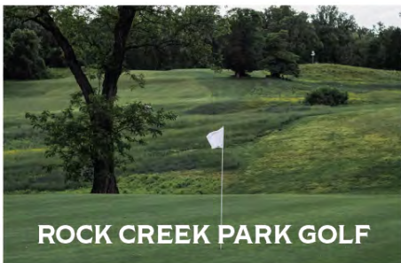
ROCK CREEK PARK GOLF

National Links Trust is undertaking the restoration and renovation of three sister properties in the nation’s capital: Rock Creek Park Golf, Langston Golf Course, and East Potomac Golf Links.