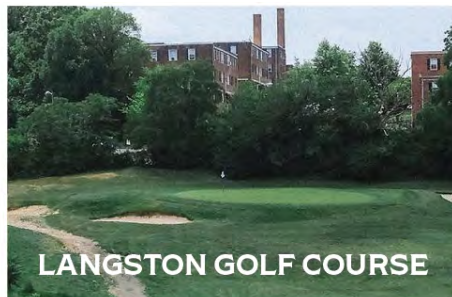
LANGSTON GOLF COURSE